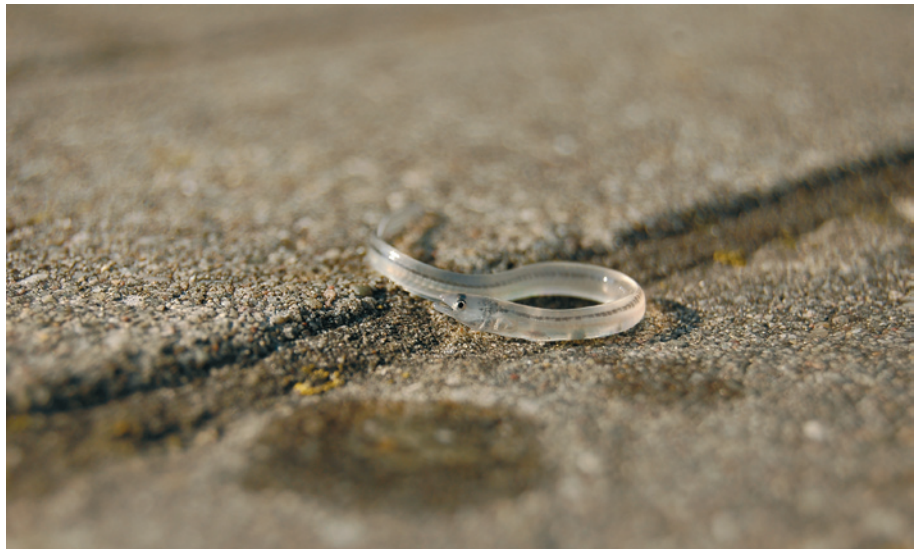
An eel in its transparent, postlarval stage, called glass eel.