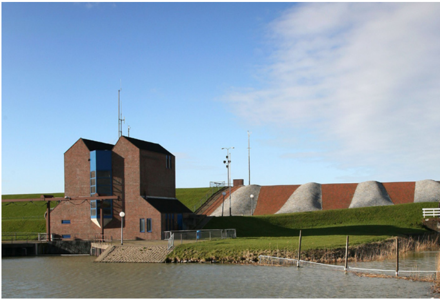
Pumping station Noordpolderzijl (the Netherlands), one of the three fish pass projects.