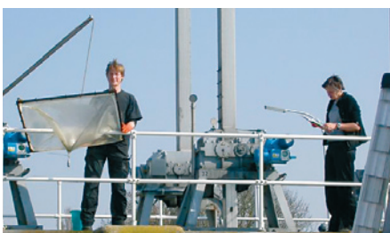
Lift net sampling near a sluice in 'Goose foot' during upcoming tide.

The solution might work for other migratory fish and shrimp as well. INBO is currently researching whether this is the case and what that means for the period in which the sluice doors are opened.